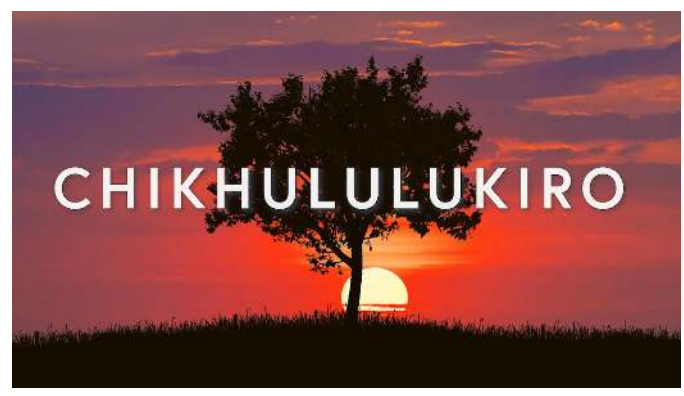
The message on Tribulation was watched by over 9,500 (Click to view video)