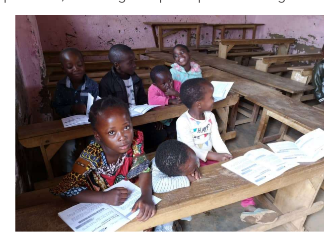
Children at Dzaleka with Bible Time Lessons

volunteer network. This will require considerable resources, but as the Lord enables, we intend to continue our site development plans, prioritising structures that will enable us to host residential Bible teaching conferences and children's camps, as well as visiting outreach teams. Covid-permitting, we aim to reintroduce MGO in 2022, and residential conferences as soon as possible thereafter.